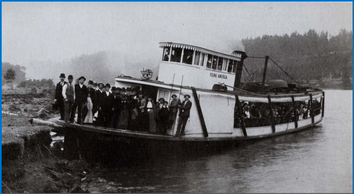
In the photo above, the Willamette River steam boat Young America approaches the river bank below the Oak Grove camp meeting site once located on the south side of Courtney Avenue.

“In 1890 the German Methodists in Oak Grove-Milwaukie purchased a 5-acre plot above the river at Oak Grove for a campground. Steamboats made regular stops at the bank below the grounds to let off and take on passengers for camp meetings and after-church picnics.” i